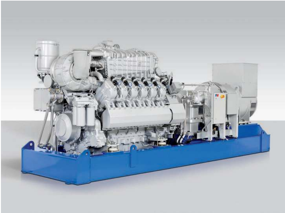
Natural gas-fueled CHP systems achieve total efficiencies exceeding 90 percent.

equipment, ventilation and electrical, as well as control systems. Each of these components must also be sized correctly, or the CHP unit will not operate optimally.